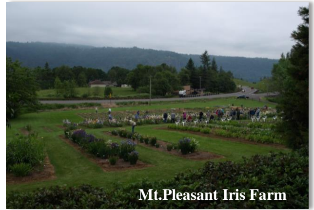
Mt. Pleasant Iris Farm

The gardens were the main event and they did not disappoint. I was continually amazed at the size of the clumps and the enormous blooms. Everything grows so well in the Pacific Northwest. It was difficult not to be overwhelmed with the profusion of colors and plants. There was something unique and inspiring to enjoy at each garden and the landscaping was gorgeous. It made me want to get home and redouble my efforts at my own garden to try to grow what I can well and quit trying to grow the impossible.