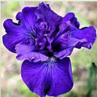
‘Blueberry Brandy’ (Bauer/Coble, 2010)

The Don Waters Award for best Iris clump hybridized within Region Six was: