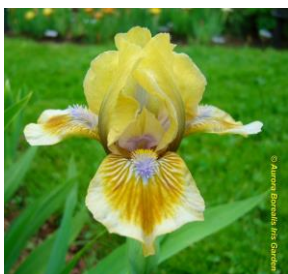
‘Pokemon’ (Sutton, 2003)

A word of caution, please do not upload pictures that are not your own without the owner’s permission. This is against TWIKI policy.