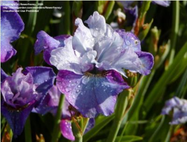
‘Star Lion’ (M.Smith, 2006)

Three iris clumps tied for the Out of Region best clump certificates. They are: