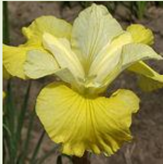
‘Kiss the Girl’ (Schafer/Sacks, 2004)