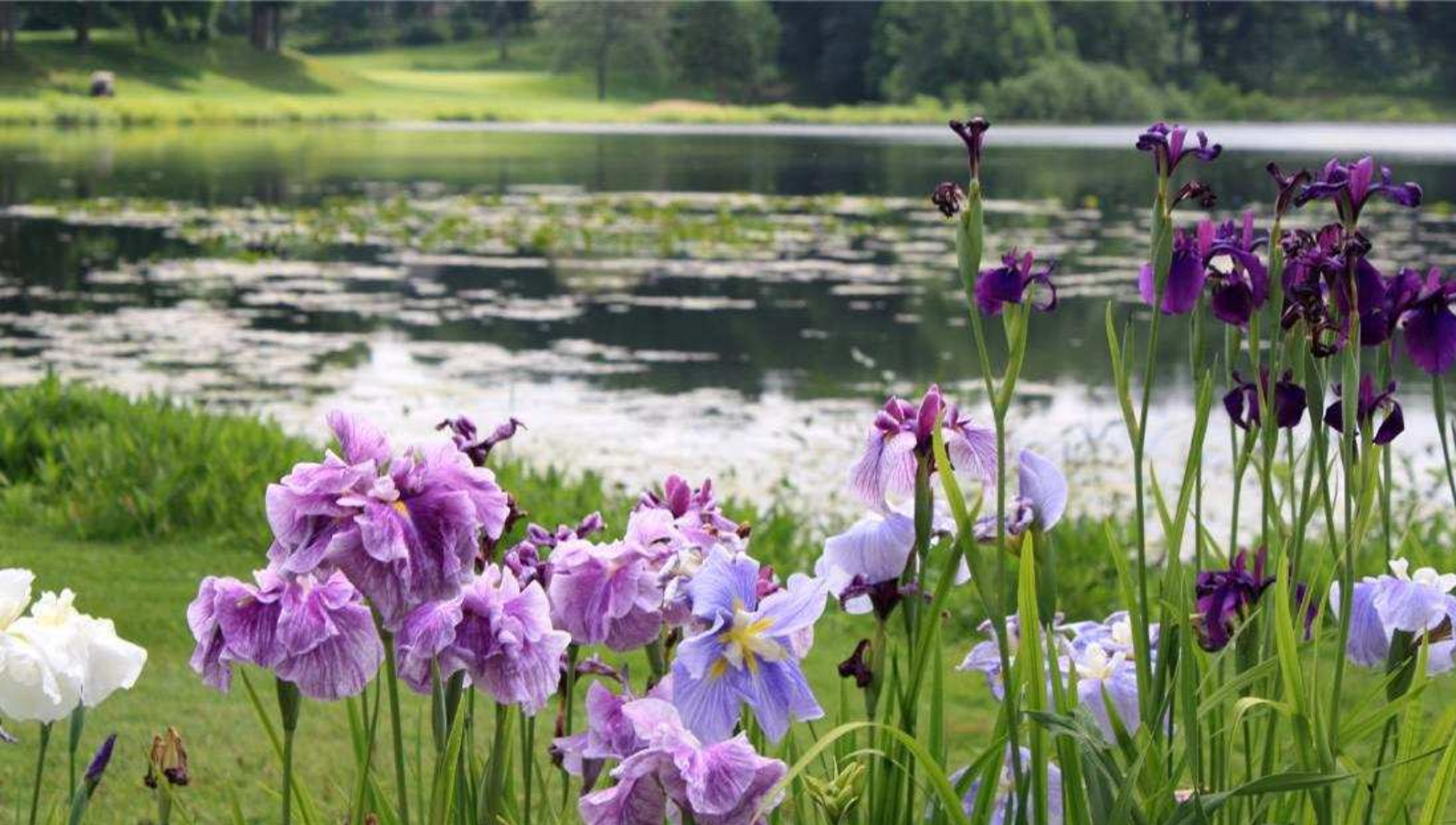
Japanese Iris at Kalamazoo Country Club