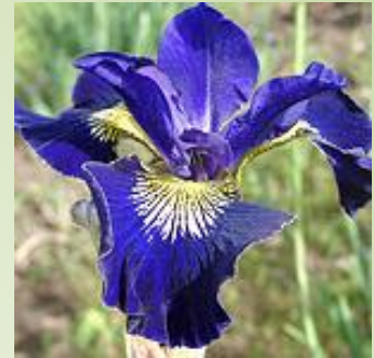
‘Dirigo Black Night’ (J.White, 2005)

The Don Waters Award for best Iris clump hybridized within Region Six was: