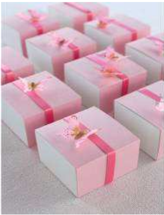
Candy Favor Boxes - $5 ea * *Available for additional themes in assorted colors