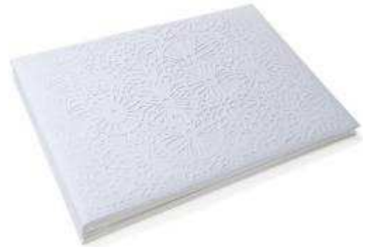
Guestbook - $45 ea * Available for all themes