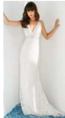
Bridal style 1019 Full-length Guipure lace bridal gown w/ hand beaded inset waistband and straps. Slight train at back. Dress available in Ivory only. Dress not available on Rush