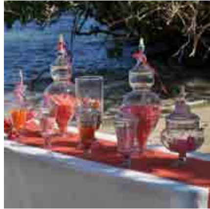
Candy Buffet - $500 based on 25 guests *Available for all themes