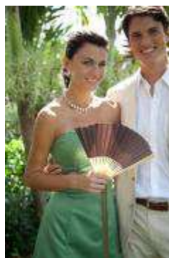
Wedding Fans - $5 ea * Available for Chic & Natural