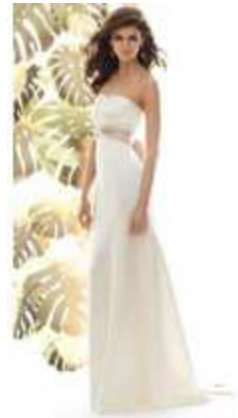
Bridal style 1015 Full-length strapless Matte Satin dress w/v-pleated bodice and medallion at empire waist