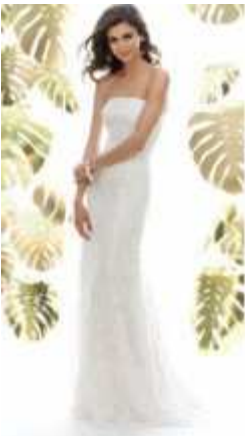
Bridal style 1016 Full-length strapless lace gown w/ sweep train