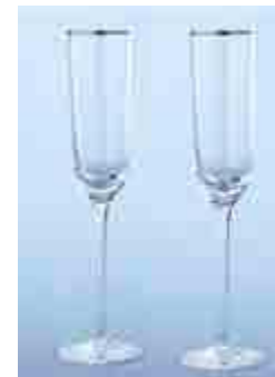
Martha Stewart Collection Wedgwood Bracelet Champagne Toasting Flutes - $100 pair