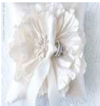
Ring Pillows - $75 ea