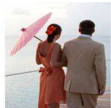
Wedding Parasols - $20 ea * Available for Island Paradise & Flutter of Romance