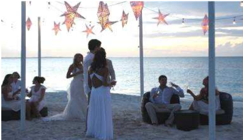
Special Lighting Package - $500 * Available for all themes (Furniture not included)

Visit our Online Gift Shop or speak with your Wedding Consultant to select your accessories and bridal party gifts!