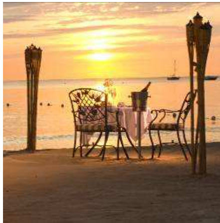
Candlelight Dinner for Bride & Groom from $170 *Décor varies by resort, please discuss with your Wedding Consultant.