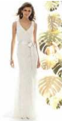
Bridal style 1018 Full-length v-neck lace gown w/ sweep train and matching ribbon belt