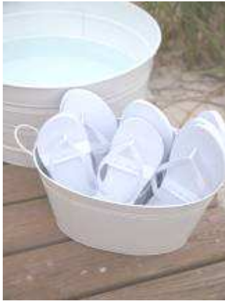
Flip Flop Station - $25 *Available for all themes