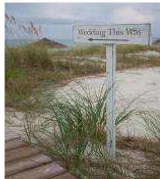
Wedding Sign - $50 rental