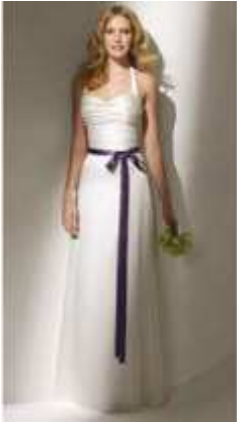
Bridal style 1011 Full-length Stretch Charmeuse dress w/ A-line skirt and sweep train. Draped bodice w/halter neckline. Contrasting Ribbon at waist