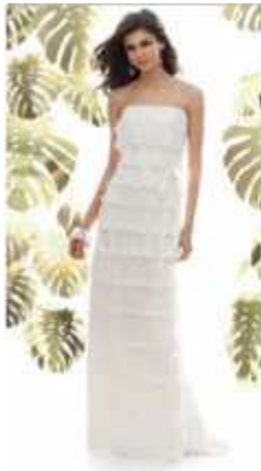
Bridal style 1014 Full-length strapless tiered Chiffon dress w/ribbon belt at waist