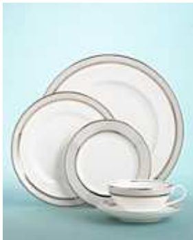
Martha Stewart Collection Wedgwood Ribbon China - $40 place setting rental * Available for all themes