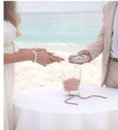
Sand Ceremony - $100 *Available for all themes