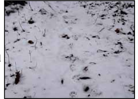
FOOTPRINTS IN THE FRESH SNOW

It was a dull, damp and cold day for walking. From the main parking lot of the Powell Wildlife Sanctuary, the trail dips as it passes through a marshy area and then rises steadily between two stone walls that follow an abandoned road. I had company. Fresh tracks in the snow were headed my way. At the trail juncture, I turned eastward following the Orange Trail. The tracks led the way before leaving the trail.