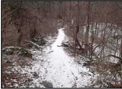
TRAIL LEADS TO DORSON'S ROCK

It was a dull, damp and cold day for walking. From the main parking lot of the Powell Wildlife Sanctuary, the trail dips as it passes through a marshy area and then rises steadily between two stone walls that follow an abandoned road. I had company. Fresh tracks in the snow were headed my way. At the trail juncture, I turned eastward following the Orange Trail. The tracks led the way before leaving the trail.