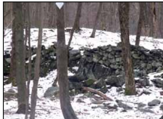
FOUNDATION WAS FOR ANIMAL SHELTER

The woods are divided by stone walls that separate ownerships and former fields. Rocks push up to ground surface following removal of forests. Farmers toiled to remove the stone from fields. Stone walls were a practical use of stone to demark boundaries and to separate fields. Stones lay across one another, bound together in a pattern of one over two and two over one. The walls have stood for decades after the stone workers and farms were gone. No easy job laying stone. Some stone at the Westside of the sanctuary weighed more than 400 pounds. Miles of stone walls at the Sanctuary and adjoining properties meant a herculean work for farm families that moved stone on stone-boats drawn by horses and oxen.