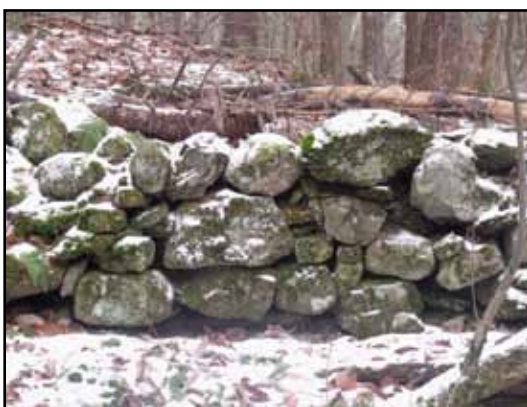
STONE WALL COMMON THROUGHOUT AREA

What had started as a desolate walk turned full of life and history. Under foot are countless animal tracks. From a brush pile a cottontailed rabbit (probably Eastern Cottontailed, Sylvilagus floridanus ) runs followed by an Eastern Gray Squirrel ( Sciurus carolinensis ). In the impassable Multiflora Rose ( Rosa multiflora ) bushes, Dark-eyed Juncos ( Junco hyemalis ) and other small birds move among the thorny branches and on ground protected from the elements and predators. The forest would be less sparse of understory vegetation were deer browsing and shade from a closed overhead canopy less.