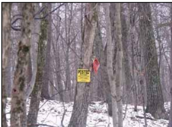
SIGNAGE INDICATES BORDER CROSSING

Plastic signs with owner's name and address mark boundary lines today. In earlier times, the owners lived on the land with the walls they built. People knew the owners of the land by association, and sometimes by the way the stone walls were built. Plastic serves its purpose to communicate property ownerships. As it ages it shreds. Stone ages gracefully. It is mottled by lichens and mosses – it is colored and patterned by the living growing on the inanimate. There is the thought of oneness of man and nature. Especially here at the Sanctuary where one can walk and see how man and nature are evolving to a sustainable relationship.