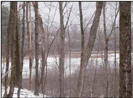
REILLY POND VIEWED FROM THE ORANGE TRAIL

Behold Reilly Pond! It appears through the leafless tree canopy beneath a snow covered plain. What a contrast from months ago when the pond was choked with vegetation, when fallen trees dotted with small turtles lying in the sun and waters full of large snapping turtles. Now it appears uncluttered, desolate and expansive.