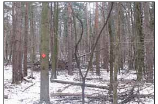
FALLEN TREES ABOUND AT THE SANCTUARY

The cry nearby of a Pileated Woodpecker ( Dryocopus pileatus ) makes clear the meaning of what is beheld. Without the dead and dying trees, where would the bird find grubs and carpenter ants in the winter months? Where does the playful crow-sized bird hide? It calls but is not seen. I stop, listen and step lightly forward. A momentary flash of bird and it disappears. Clever bird I think. Most life this season is hidden from view but not memory. Bracken, or shelf fungi, observed as conks, grew on tree trunks indicating wood-rot. Wood-rot releases minerals, nutrients and organic matter. The trees' death helps renew soil tilth.