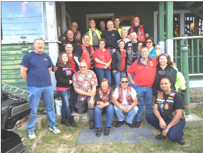
Outside Stoney Creek Inn before our dinner during Americade week.