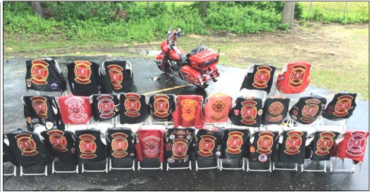
A collection of vests in attendance at the 2015 Yankee Rally. Information on the 2016 Rally included in this newsletter. "LIKE" the 2016 Yankee Rally on Facebook for up-to-date info

President, New Jersey State Association of Red Knights President, RKMC, New Jersey Chapter 31