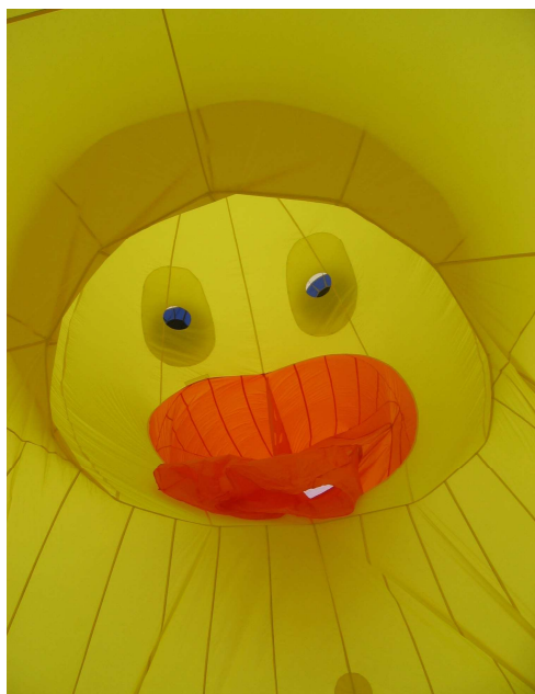
A view from inside "What the Duck"