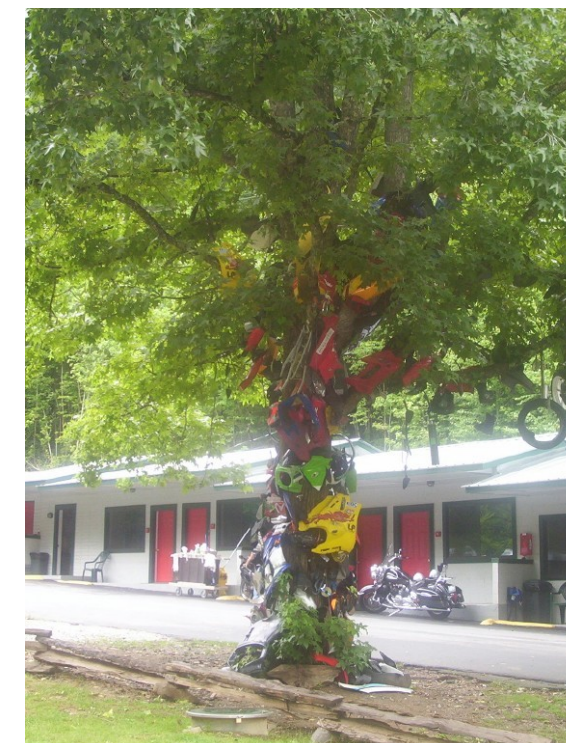
The "tree of shame" peices of 'rice rockets' that bought it on the dragon