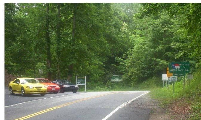
All of us lined up on the TN/NC state line.