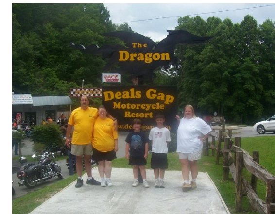
Deal's Gap "Motorcycle Resort"

The next morning, we checked out and headed up the Dragon for one last conquer. We had a blast! The cabin in the woods was exactly what the doctor ordered. The scenery was beautiful. And the bonds with my club mates made memories of a lifetime.