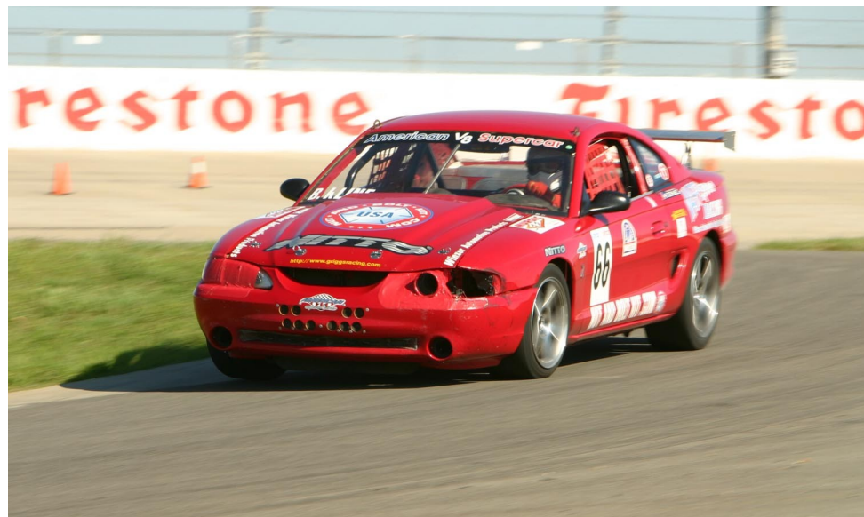
Rehagen Racing/Speedquest/TheMustangSource.com Grand Am Cup '05 Mustang at Barber Motorsports Park Birmingham Alabama