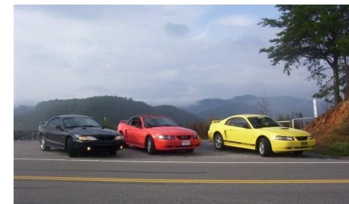
All of us lined up at the bottom of the dragon near the Topoco Lounge at the Cheoah Dam pull over