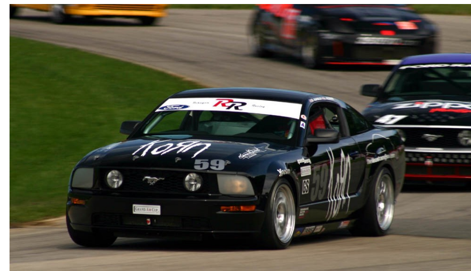
Rehagen Racing/Speedquest Grand Am Cup '05 Mustang at Mid-Ohio Sports Car Course

As we complete another year it is time for everyone to think about running for an officer and or board position within the club. Many of the current serving team has decided not to run again which means we need people interested in continuing in operating the club. If you have questions please ask any officer or board member.