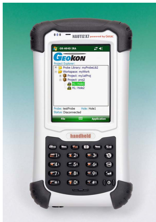
Figure 2 – The FPC-1 Handheld Readout