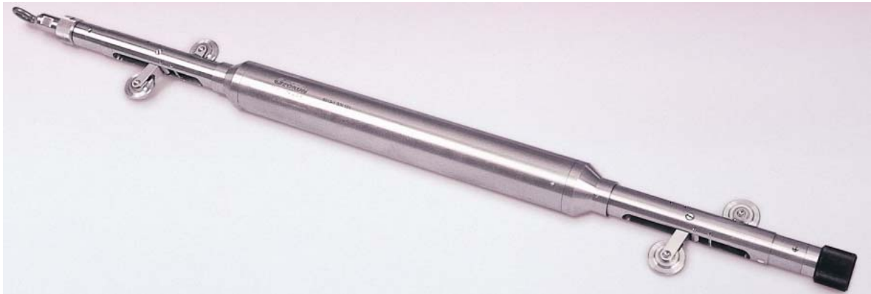
Figure 1 - Horizontal Inclinometer Probe

Figure 1 shows the horizontal inclinometer probe. The probe is designed to be used in conjunction with a special cable connected to a readout box and to be used with grooved inclinometer casing. This manual describes the use and maintenance of the inclinometer probe and cable. Further details of the operation of the FPC-1 readout box (Figure 2), are to be found in the GK-604D manual; and for installation of the inclinometer casing in the Model 6500 installation manual.