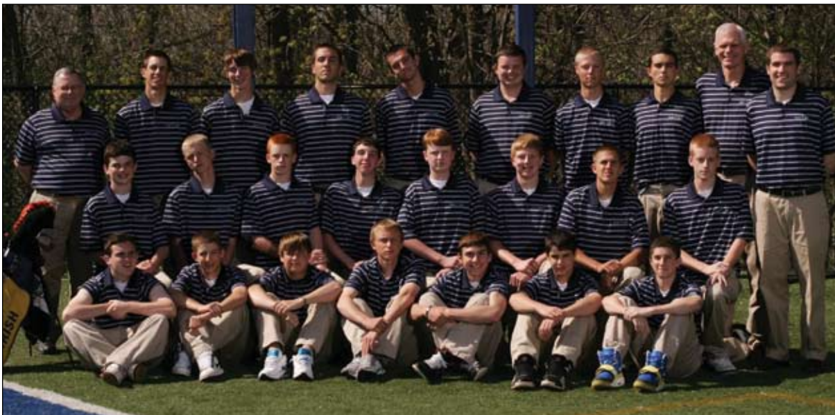
Young talent is developing that will help the Irish compete well in coming seasons.