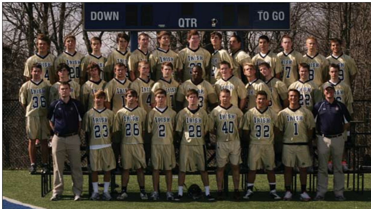
Hard work will return a young team to the Final Four in the 2011 season.