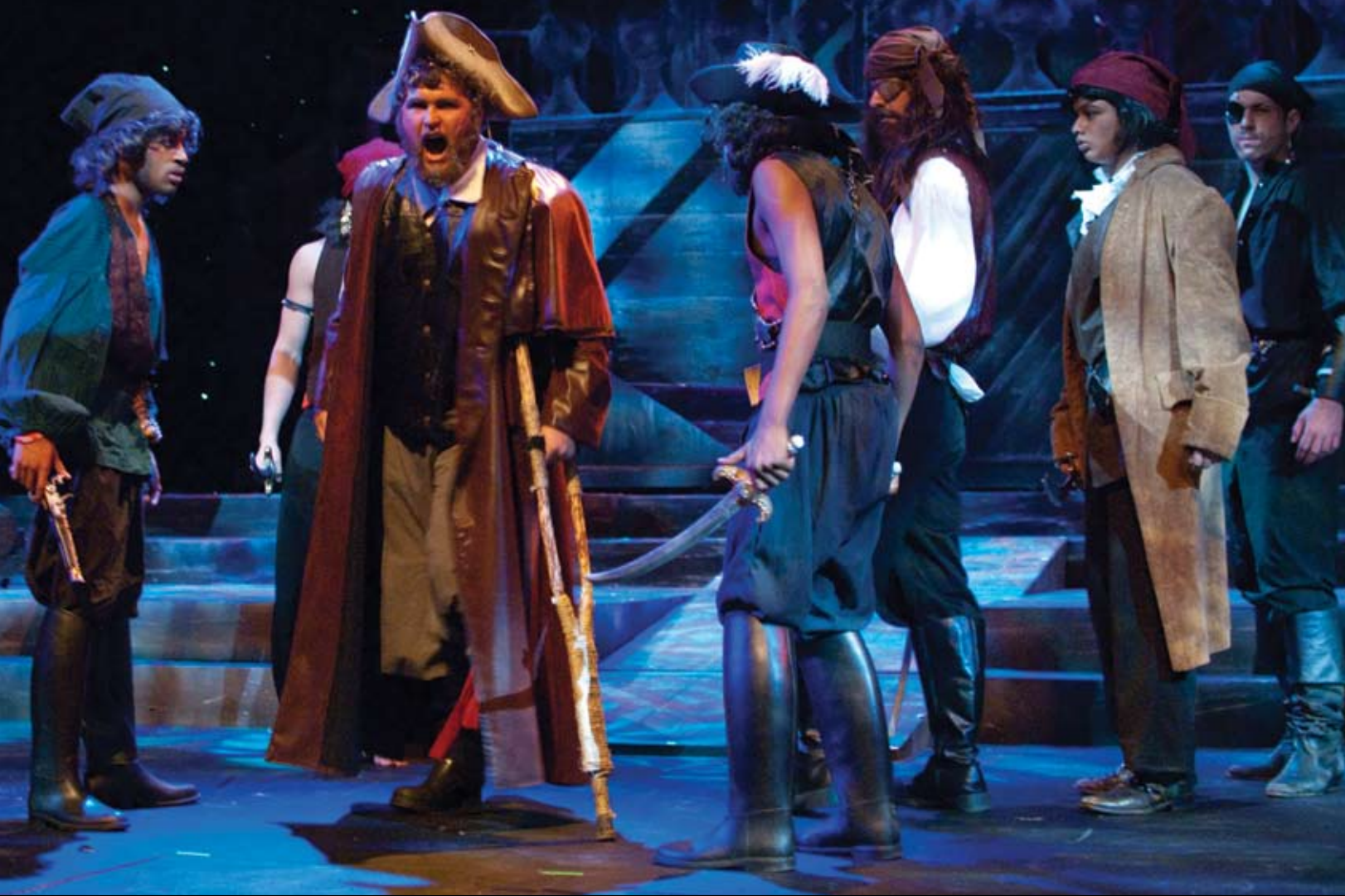
Highlights photos/Andy Bowman