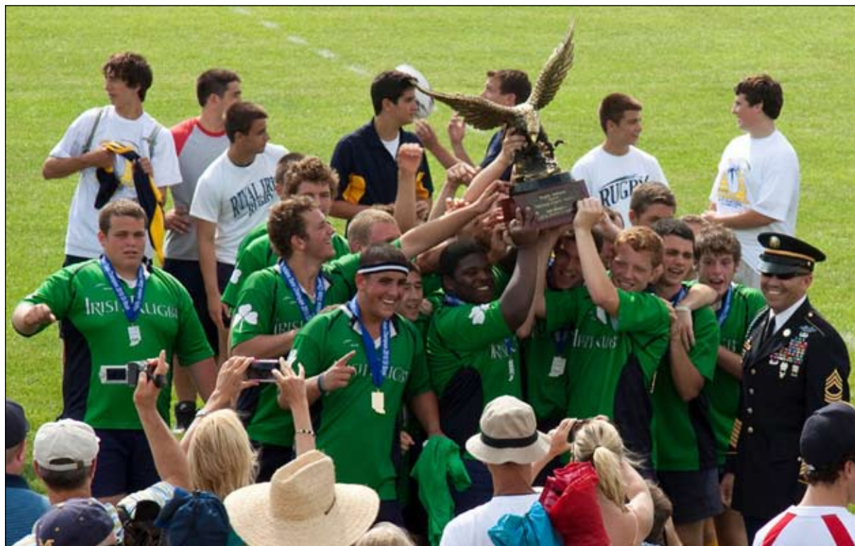
Another title means more hardware for the Irish trophy case.