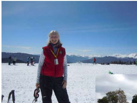
Top of Vail Colorado

I enjoy the friendly competition at the DSO shows, helping out where I can, and now sharing all my "extra" plants with all my friends. It's the end of April now and my living room is currently filled with trays of soil and tubers and they are sprouting nicely. Looking forward to it finally warming up so I can put them out on the porch and reclaim my space. We've since made raised beds for them so if it happens to rain another 3" this summer we've got it covered. "Delightful Dahlias". Yes they are.