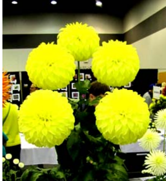
Five wonderful (Yellow FD!) Edna Cs at the 2014 National show

should probably use special entry tags for the Novice sections so we can provide feedback on the basis for our conclusions. Be sure to write a short note on the current entry tags to help exhibitor understand what might be a confusing choice to them.