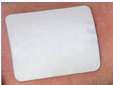
The Headstart Pepperpatch

We will ask you to rate any discomfort or pain you have before, during and after the study patch application.