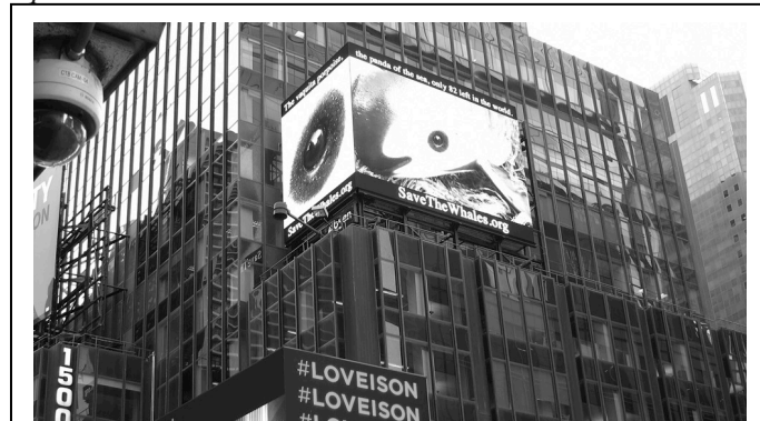
Vaquita on display on digital banner in Times Square. (Credit: Savethewhales.org).

To see the banner in motion, visit http://www.savethewhales.org/vaquita82_Times-Square.html .