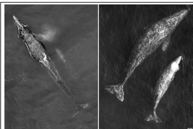
Blubber is crucial for survival: the skinny mother on the left may not have enough reserves for her to reach the Arctic while nursing her calf.

The height of the hexacopter is a key concern, because whales and other marine species are sensitive to disturbances in their environment. So the contraption is fitted with a precise altimeter to monitor