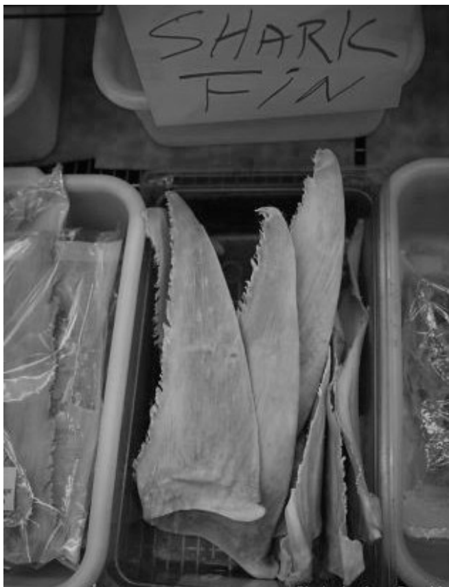
Shark fins for sale.

It has established that blue whales are the strongest, in terms of the absolute amount of force they can generate. They are stronger than other large whales, including the massive sperm whale, the largest toothed cetacean, although they are not the strongest relative to their body size.