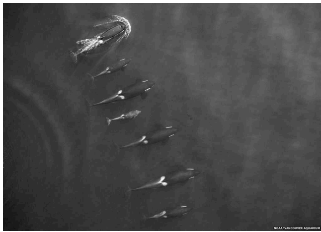
Dr Durban's team also used drones to observe killer whales - like this family of seven (Credit: NOAA / Vancouver Aquarium).

how high it is. That helps with analysing the pictures, but also means it can keep a safe distance.