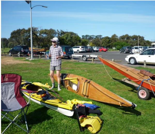
Several members took canoes to Barwon Heads