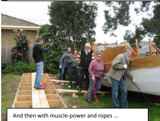
And then with muscle-power and ropes ...