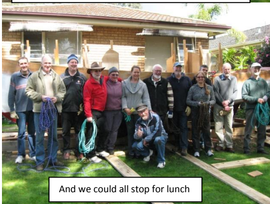
And we could all stop for lunch