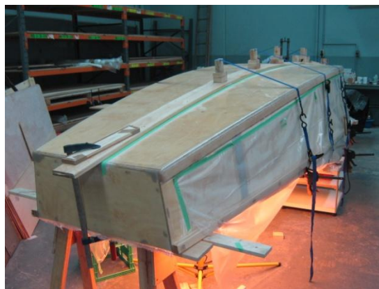
Affixing the laminated keelson with E-Glue. Lamination (2 layers) was done in-place with Purbond.