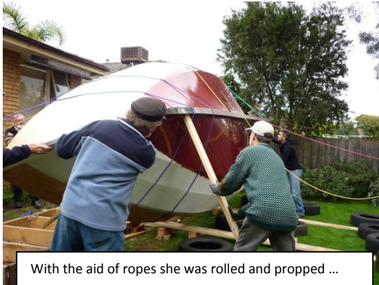
With the aid of ropes she was rolled and propped ...