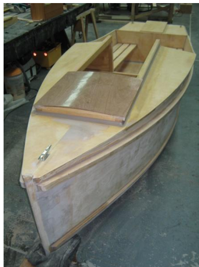
Forward fixed 'slot-deck' cover with slight arching so water doesn't pool.

some. The reasonably narrow aspect ratio indicates it should have a good turn of speed in light to moderate winds, up to hull speed. The wide flat bottom gives it high initial stability and shallow draft, another typical feature of many basic sharpie