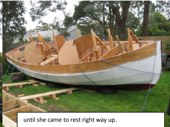
until she came to rest right way up.