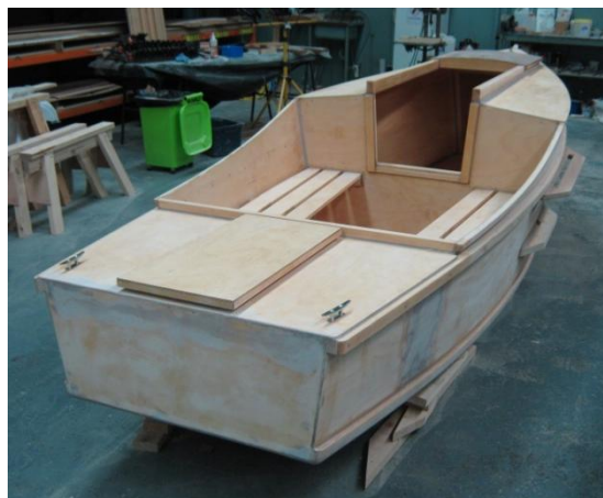
Simple slatted bench seats. Note the upper leeboard guard & lower mounting rail on starboard side.

keelson, covered with 200gsm fibreglass cloth.