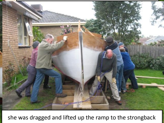
she was dragged and lifted up the ramp to the strongback