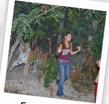
Evening Roar 2012

This summer and fall the EFRC hosted many wonderful special events. We thank all of our friends who came out for two Evening Roars and the large groups of family and friends who made both Fall Fest and Pumpkin Party such terrific days. As we witnessed again, nothing gets our cats talking like the sound of over 100 motorcycles rumbling down Ashboro Road for Rescue Ride!