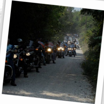
Rescue Ride 2012