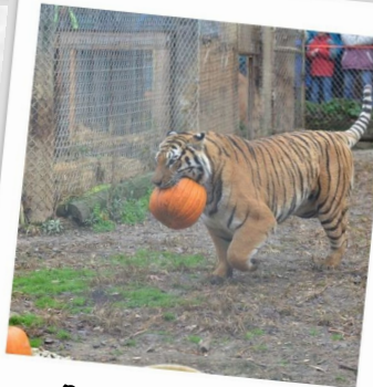
Pumpkin Party 2012

Thank you to all our organizers, sponsors, staff and volunteers for pitching in and making these events truly successful.