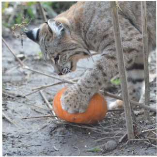
Pumpkin Party 2012