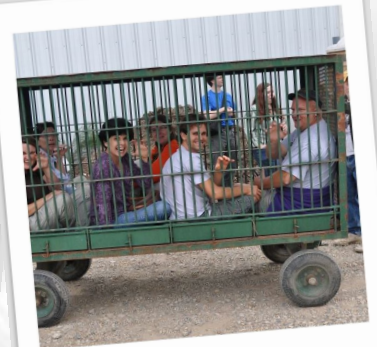
Fall Fest 2012

A special thank you to our friends at Beasley's Orchard in Danville, Indiana for donating nearly 150 pumpkins for Pumpkin Party!