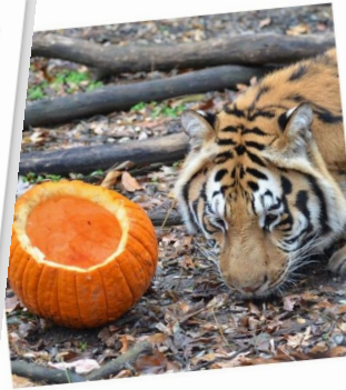
Pumpkin Party 2012