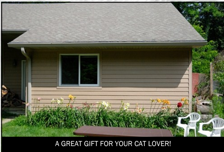
A GREAT GIFT FOR YOUR CAT LOVER!