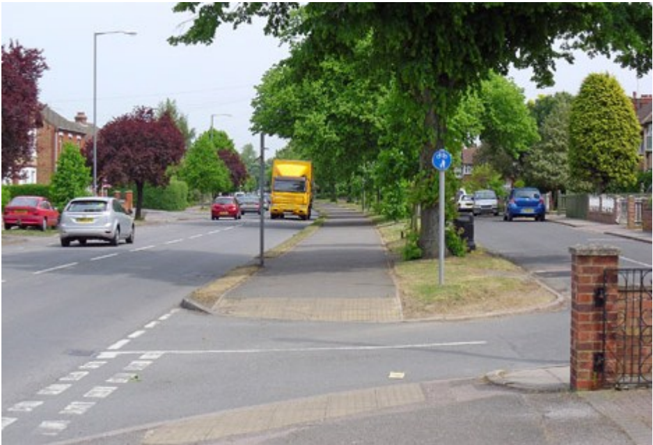
View along looking east near the set-back section of Goldington Road

At the Newnham Avenue end the cycle section has a unsatisfactory link onto the main carriageway just before the junction which could cause some concern for inexperienced cyclists. Unsure cyclists would be better to dismount and walk across the junction using the pedestrian controlled phase of the junction lights.