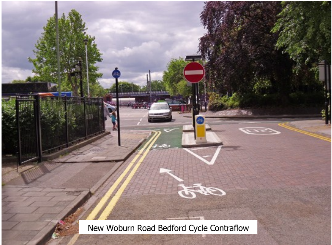
New Woburn Road Bedford Cycle Contraflow