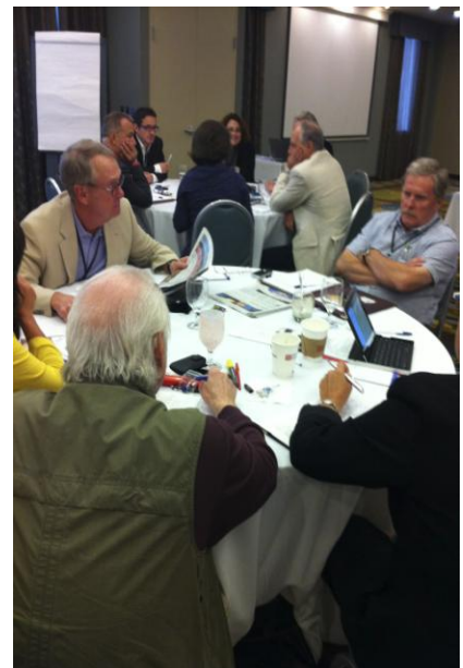
Consultation group in Toronto hard at work

complete the survey online, or willingly shared ideas, which were recorded and have been added to the responses.