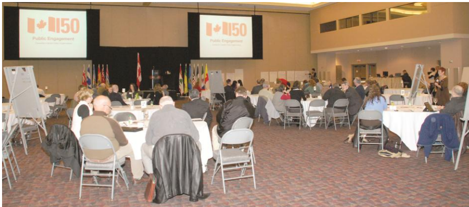
Consultation group in Victoria

The project entailed holding public consultations in all fourteen Canadian capitals, reaching a minimum of 5,000 people, and, using social media and other tools, asking the public to complete surveys on Canada's sesquicentennial describing how they would like to celebrate and mark the anniversary in 2017 (see Appendix for English and French versions).