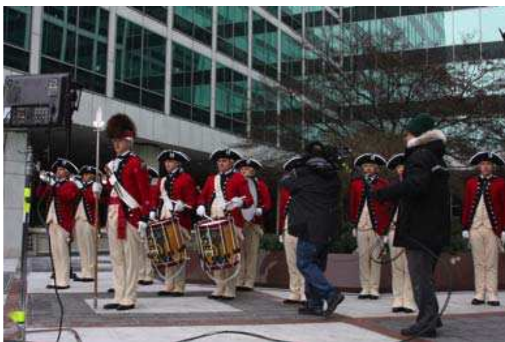
Old Guard Fife and Drum Corps performs on the NBC Today Show outside NBC Studios, D.C. 2009.