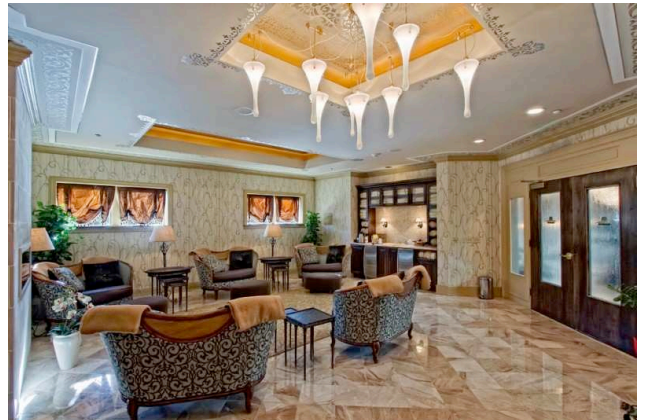
Spa at the West Baden Springs Hotel

Established in 1845, French Lick Springs Hotel attracted guests from around the world to experience the "miracle waters" of its nearby sulfur springs. Now this classic hotel has been restored to its famed charm and grandeur.