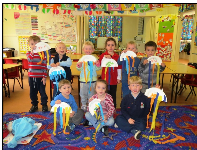
So many bright and vibrant jellyfish!