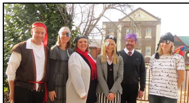
A slightly different dress code for the staff on Pirate day too!