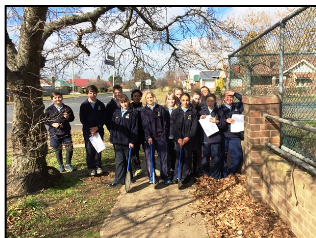
Year 6 students making the most of the sunshine while studying mathematics.

Year 6 students took their numeracy lesson outside, enjoying the sunshine, while learning about perimeter. Some students used a trundle wheel, while others simply paced the distance, to determine the approximate perimeter of the school block. And the result? About 505 metres. What a great way to apply mathematics to the real world!