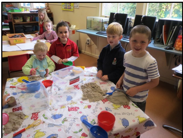
Once again the Flying Starters enjoy time to dig and sculpt in the kinetic sand!

Superb art and imagination was on display at Flying Start this week with the 'Flying Starters' creating not one fantastic creature, but two! We began by constructing a cute and fuzzy eight legged spider with wide googly eyes using vibrant pipe cleaners and foam balls. After a few songs and the narrative Mister Seahorse by Eric Carle, we further stretched our artistic talents by creating a bright and fun jellyfish. Please enjoy the following snaps from the day!