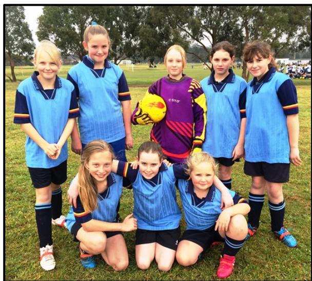
Our girls ready to rumble.