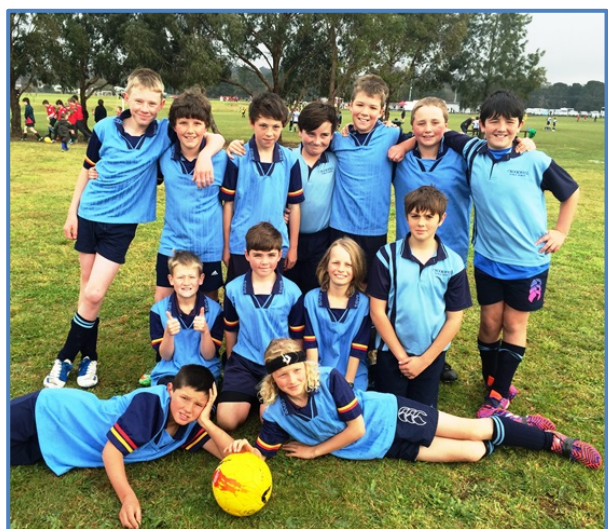
Our boys pumped to play.