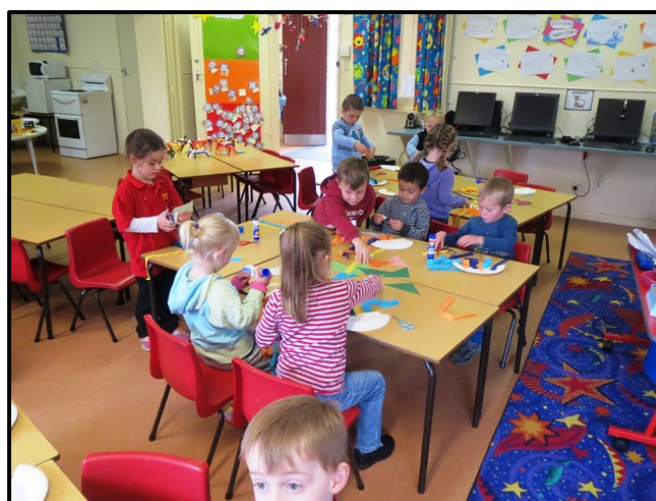
The Flying Starters work in teams during some art making.