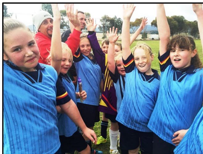
The girls getting geared up with their coaches.