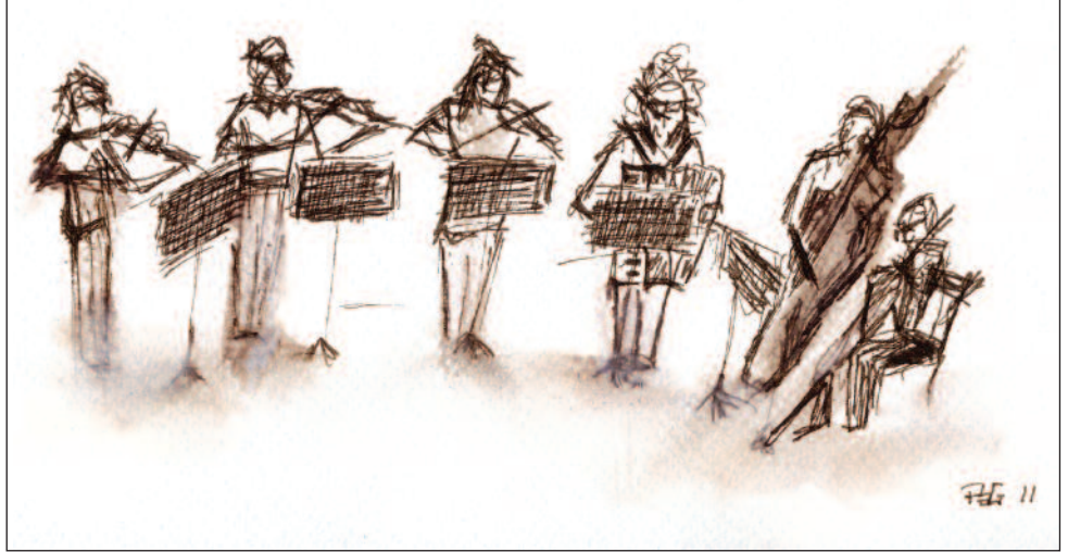
Oxford Concert Party, HMP Shepton Mallet