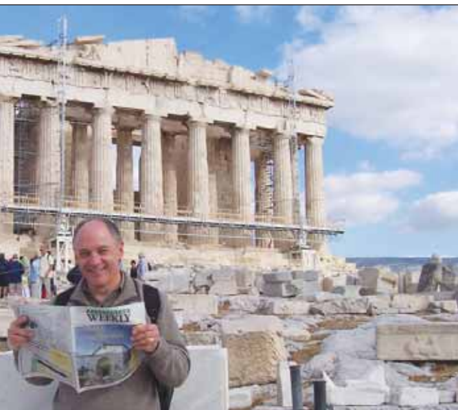
Weekly The Weekly in the wind at the Parthenon on the Acropolis in