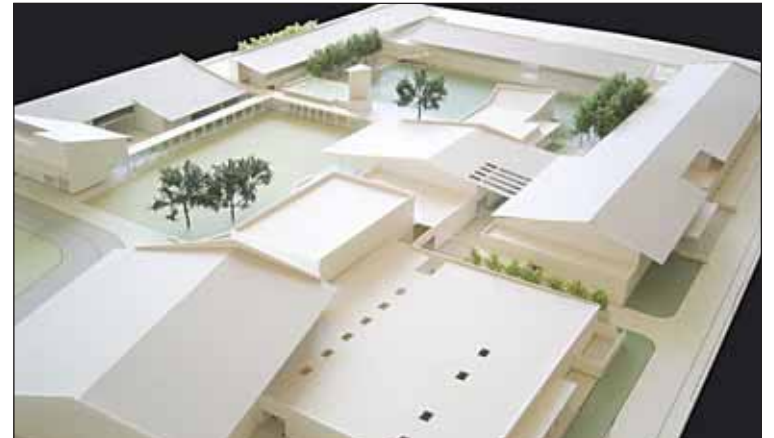
A 3D model shows what a Catholic high school in northeastern Livermore, to be called Pope John II Catholic High School, would look like.

The new Catholic college preparatory high school will accommodate a coed student body of 1,200