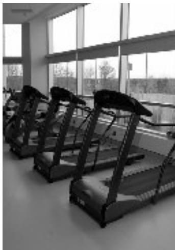
New exercise equipment in the physiotherapy department