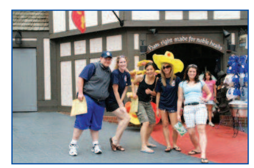
Having fun together...