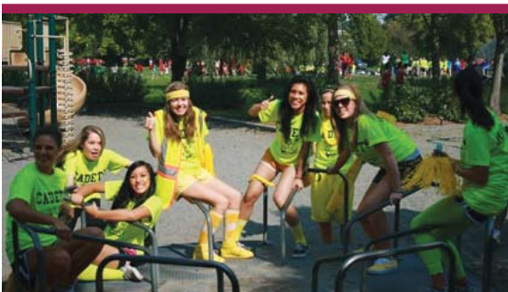
Cadets (Class of 2011-Juniors) brighten the Montlake Playfield in yellow.

In an Academy tradition now extending over three decades, the entire student body gathered in September for the HNA Jogathon, a student fund-raising—and “fun-raising”—event to benefit the school’s athletic program. This year’s 30th annual Jogathon netted more than $100,000, a record, to help underwrite the Academy’s ever-growing sports program. Students enlisted support from relatives, neighbors, and family friends by pledging to jog or walk laps around the Montlake Playfield track.