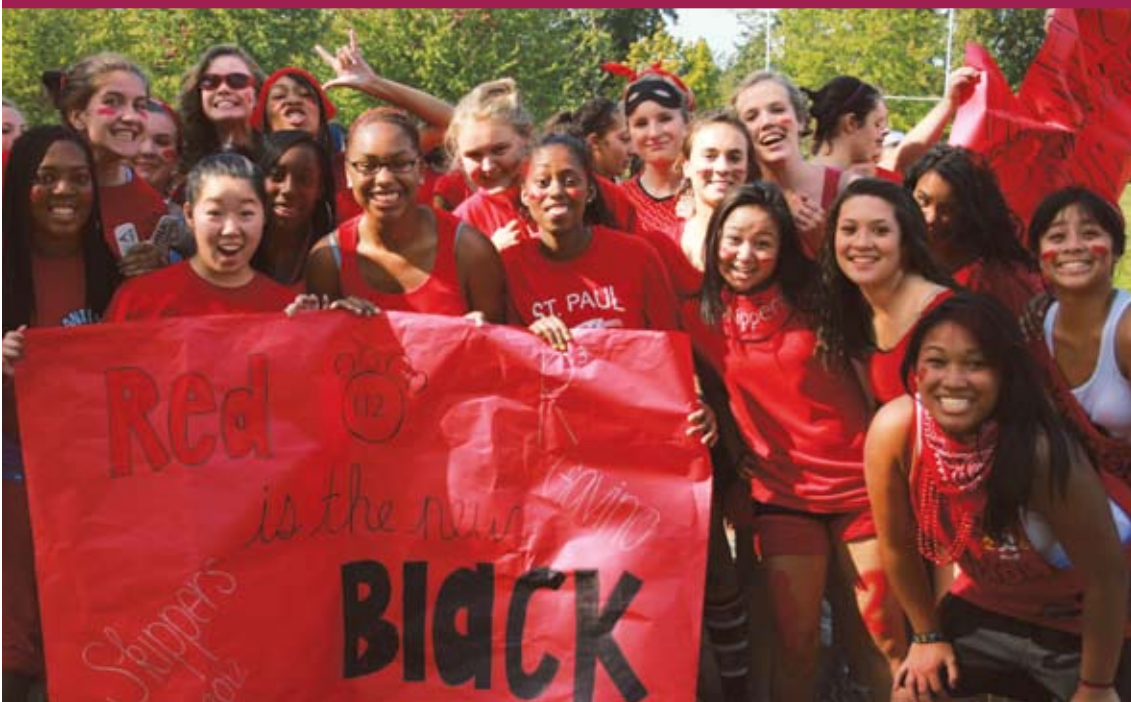
Skippers (Class of 2012-Sophomores) show their class spirit by declaring red is the new black.