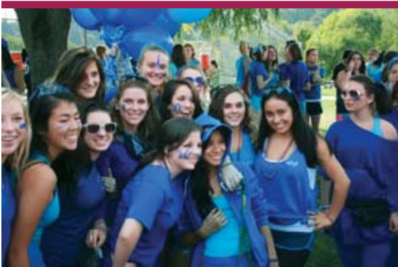
Pipers (Class of 2010-Seniors) sport their true blue colors!