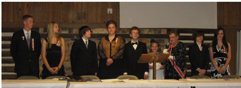
Newly Elected 2010-2011 C of C Texas State Officers