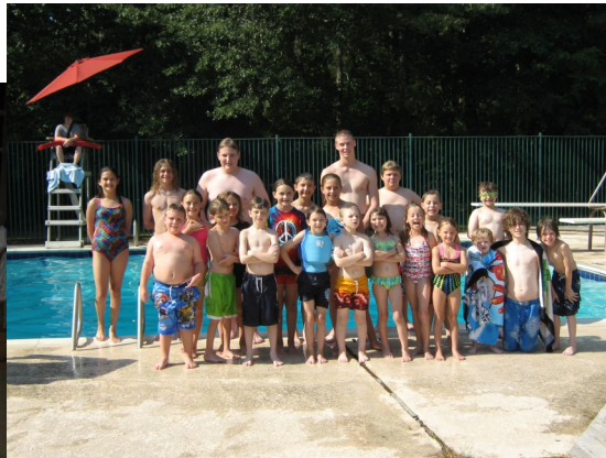
Almost everyone at the Pool