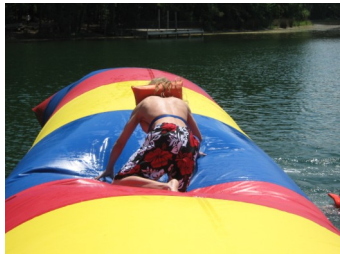
THE BLOB !