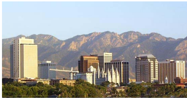
Skyline of Salt Lake City ▲

Every Windemuth descendent is invited to attend the 2007 biennial Windemuth International Family Reunion! It will be held