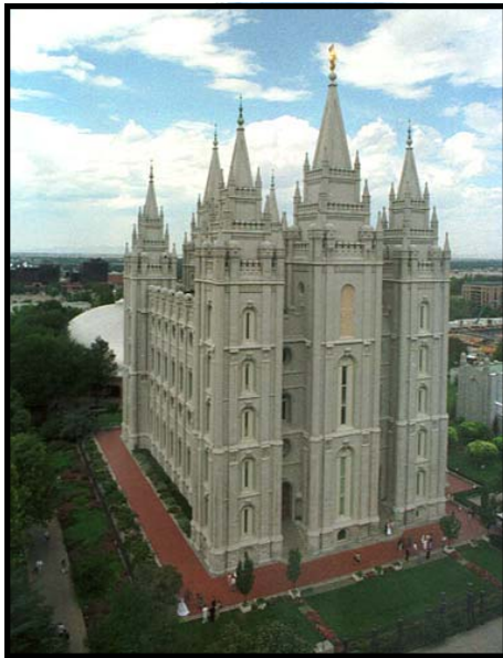
◀ LDS Temple

The August 1- 3, 2007 Reunion Promises a Great Time for All!