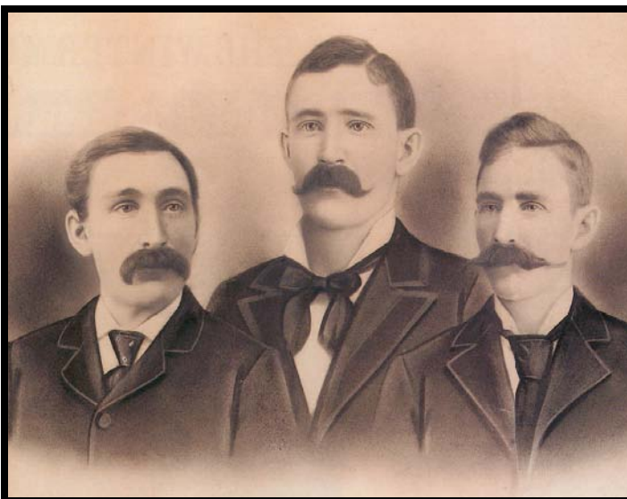
Circus World Museum, Baraboo, Wisconsin

Please e-mail stories as well as high resolution historic photos for publication in future newsletters. Be sure to include names, dates and locations. E-mail them to: gdennis@universalsys.com .