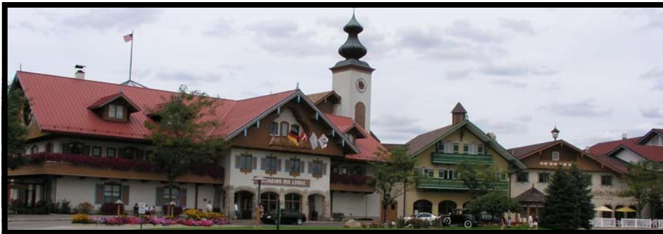
Headquarters hotel — Bavarian Inn Lodge at Frankenmuth, Michigan

oriented town, located on the Cass River and features a scenic paddlewheel boat tour, exceptional shopping (including Bronner's, the largest Christmas deco-