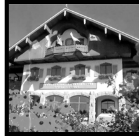
Frankenmuth provides a taste of our German heritage.

Family Reunion in Frankenmuth, Michigan, USA, August 10-12th, 2005.