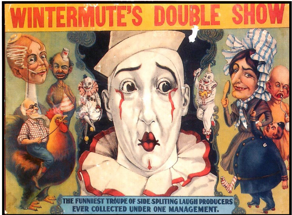
Circus World Museum, Baraboo, Wisconsin