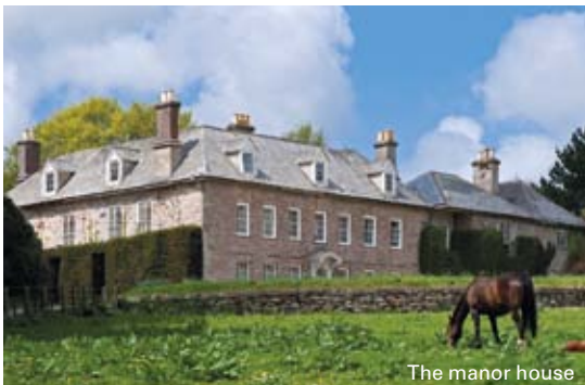
The manor house

Penzance: town/resort on a beautiful bay in which is St Michael's Mount . Seafront promenade; entertainments, cinemas, theatre; good shops; museums, galleries; harbour (boats to Scilly Isles ); railway. Newlyn (fishing village, famous gallery), and Nat.Trust gardens (Trenegwainton), 1 mile; Mousehole (see page 209), 2; St Ives (see page 211), 7; Land's End , 10. Marazion (nearest beach), 2 miles.