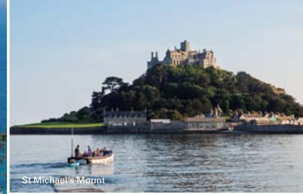
St Michael's Mount