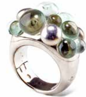
22 An 18 Karat Gold and Green Quartz Ring, Pomellato Designed as a cluster of green quartz and white gold 'bubbles' mounted in 18K white gold. Signed Pomellato, stamped 750, Italy. Size 7 Estimate: $3,500 - $5,500