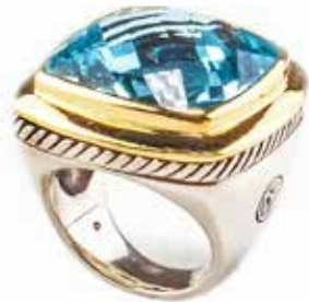
24 An 18 Karat Gold, Sterling Silver and Topaz Ring, David Yurman Set to the center with a square-cut blue topaz, bezel set in 18K yellow gold to the sterling silver shank. Stamped DY for David Yurman. Size 5 3/4 Estimate: $500 - $700