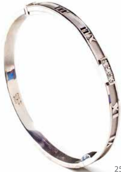
25 An 18 Karat Gold 'Atlas' Bangle Bracelet, Tiffany & Co. Designed as a hinged bangle with roman numerals and accented by diamonds, approximate gross weight 18.4 dwts, inner diameter approximately 2.5 in. - 6 cm. Signed T&Co. Italy, stamped 750 Estimate: $3,000 - $4,000