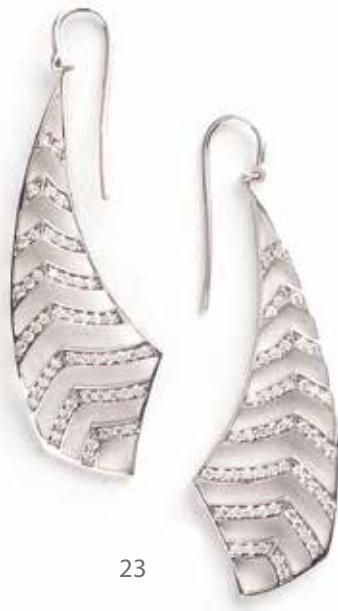
23 A Pair of 18 Karat Gold and Diamond Earrings, Ron Hami Each of openwork design, accented by brilliant-cut diamonds, mounted in 18K white gold, length approximately 2.10 in - 5.3 cm. Signed Hami and stamped 18K. Estimate: $1,500 - $2,000