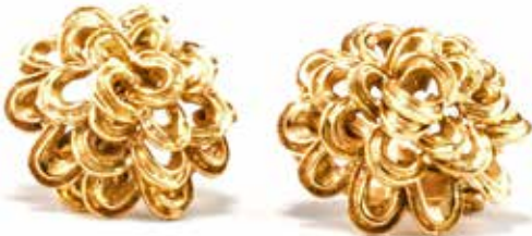
40 An 18 Karat Gold Ring and Pair of Earrings

The ring designed as a cluster of coils, forming a bombé figure; matching earrings en suite. Approximate gross weight 19.1 dwts, ring size 6 3/4, earrings with clip and post fittings, stamped 750