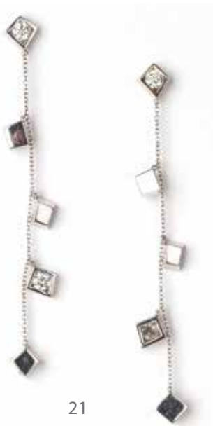
21 A Pair of 18 Karat Gold and Diamond 'Torque' Bead Drop Earrings, Frank Gehry for Tiffany & Co. Each comprising four small gold cubes, one accented with a circular-cut diamond, to the diamond surmount, measuring approximately 2.5 in. - 6.5 cm. Signed T&Co. Gehry, stamped 750 Estimate: $2,500 - $3,500

FRANK GEHRY FOR TIFFANY & CO. Labeled by Vanity Fair as "the most important architect of our age," Frank Gehry has been commissioned to design numerous buildings around the world including the famed Guggenheim Museum in Bilbao, Spain. The "starchitects'" pieces for Tiffany & Co. exemplify his signature style – fluidity with a sculptural essence.