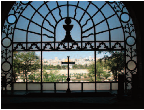
View from the church of Dominus Flevit, Mt of Olives