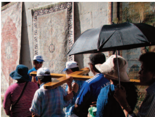
Pilgrims walk the Via Dolorosa