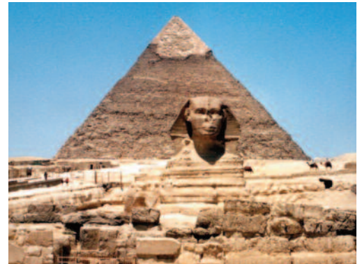
The Great Pyramid and Sphinx in Cairo