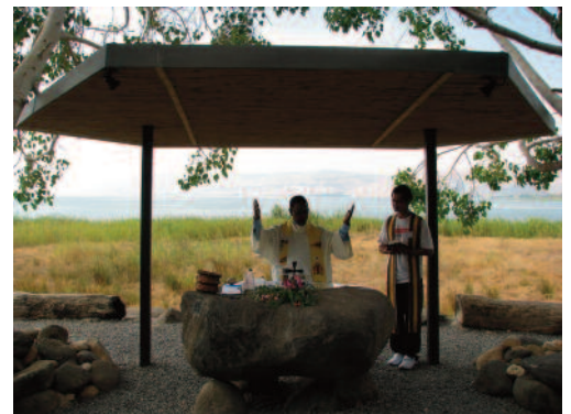
Mass will be celebrated every day