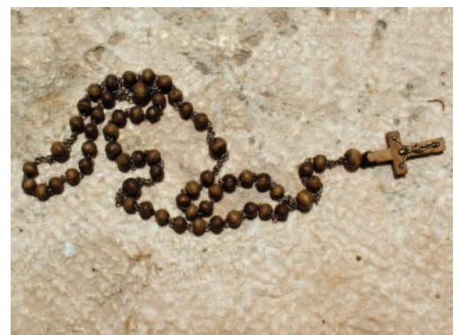
A pilgrimage is a prayerful time...