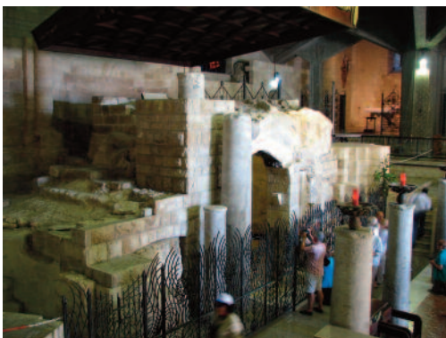
Mary's Grotto in Annunciation Basilica, Nazareth