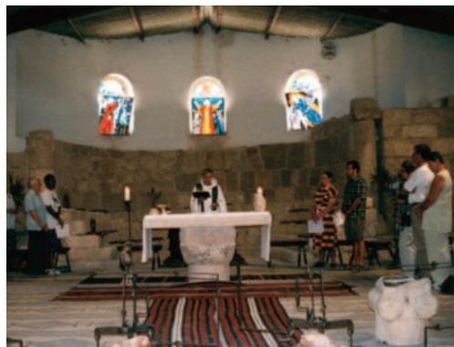
Mass in the Franciscan church on Mount Nebo

Jerusalem! We begin our pilgrimage to the Holy City on top of the Mount of Olives at the small chapel, now a mosque, which marks the spot from which Catholics believe Christ ascended into Heaven (see his reputed footprint in a stone there). As we walk down the mount we visit Paternoster Church , where the Lord's Prayer is displayed in hundreds of languages, including several South African versions, and Dominus Flevit Church , which is on the spot where Jesus wept for Jerusalem. At the foot of the mount we arrive at the Gethsemane with its ancient olive trees, and the magnificent Church of All Nations with the rock