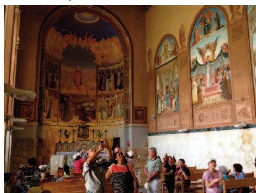
The Church of the Visitation in Ein Kerem