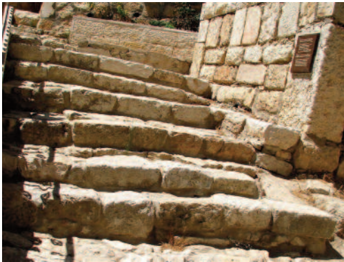
Steps on which Jesus walked on Mount Zion