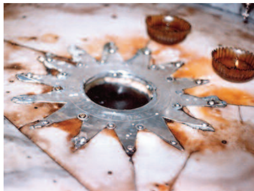
The spot of Jesus' birth in Bethlehem