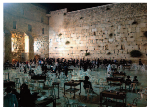
...and a time to see great sights