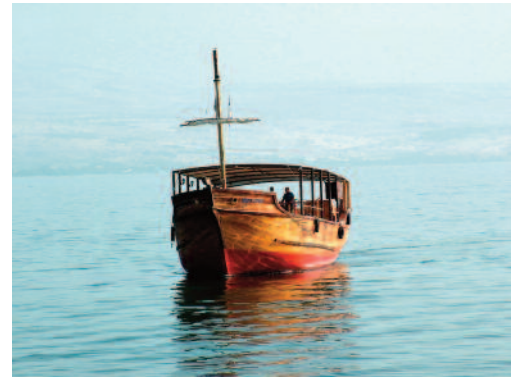
Pilgrims on the Sea of Galilee