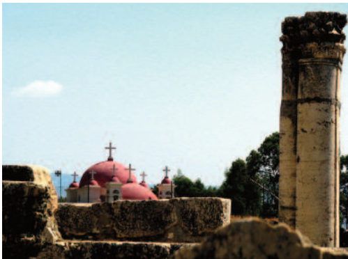
Capernaum, Jesus' HQ in Galilee

on which Jesus is believed to have prayed before his arrest. Across the street we visit Mary's Tomb , from which Our Lady was assumed into heaven.