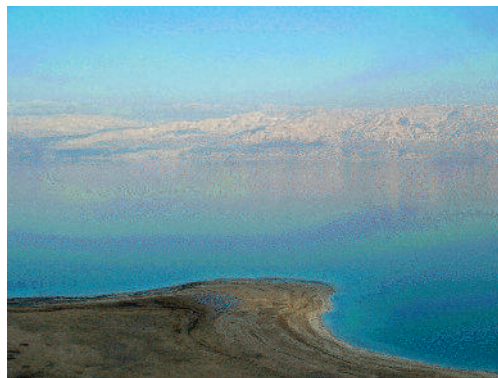
The Dead Sea, looking towards Jordan.