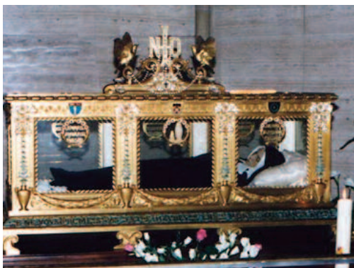
St Bernadette's incorrupt body in Nevers