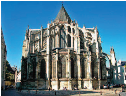
Saint-Gatien cathedral in Tours