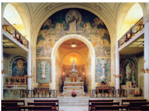
Convent Chapel of Rue de Bac, Paris