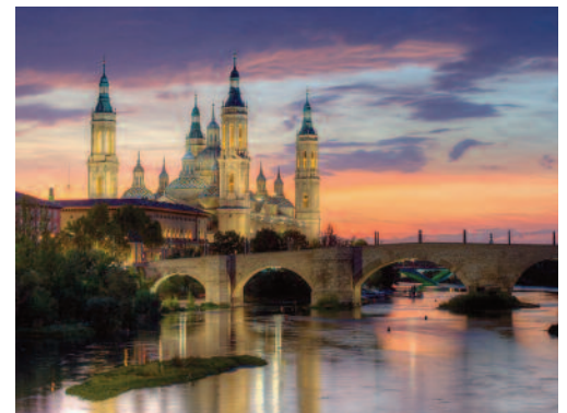
Basilica of Our Lady of the Pillar in Zaragossa