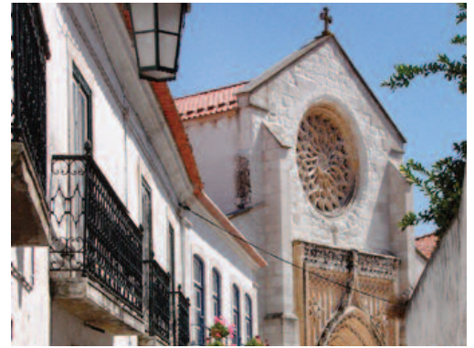
Santarém, birthplace of St Anthony of Padua

We leave Tours for Lisieux , the city of St Thérèse, another Doctor of the Church. We visit the Basilica of Sainte-Thérèse , one of the biggest and most impressive churches the 20th-century, as well as Les Buissonnets , St Thérèse’s