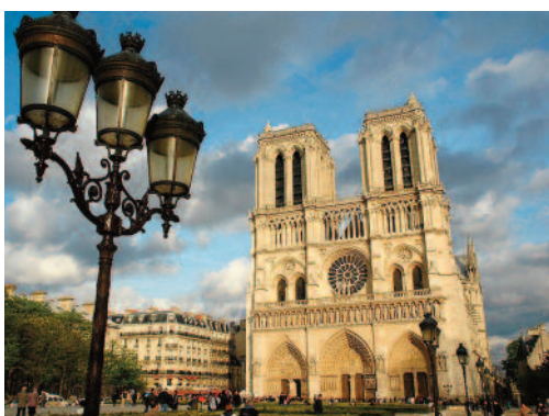
Notre Dame Cathedral in Paris

family home where we see relics, clothing and other personal objects belonging to the "Little Flower". We then proceed to Paris. Overnight: Paris