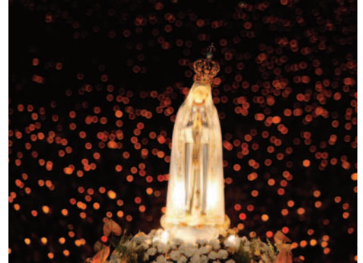
Candlelight procession in Fatima