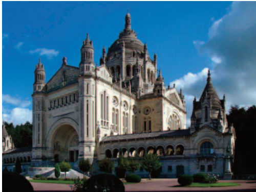
Lisieux's magnificent cathedral