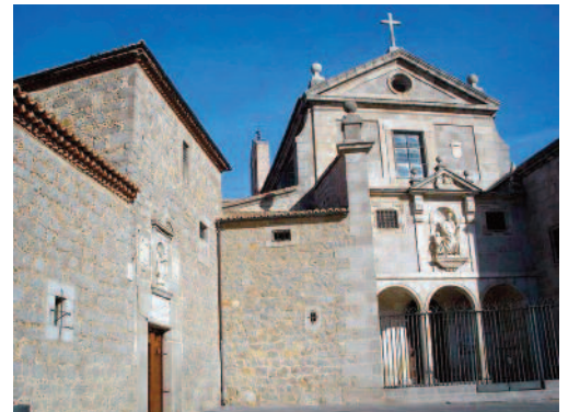
The Convent of St Joseph in Avila