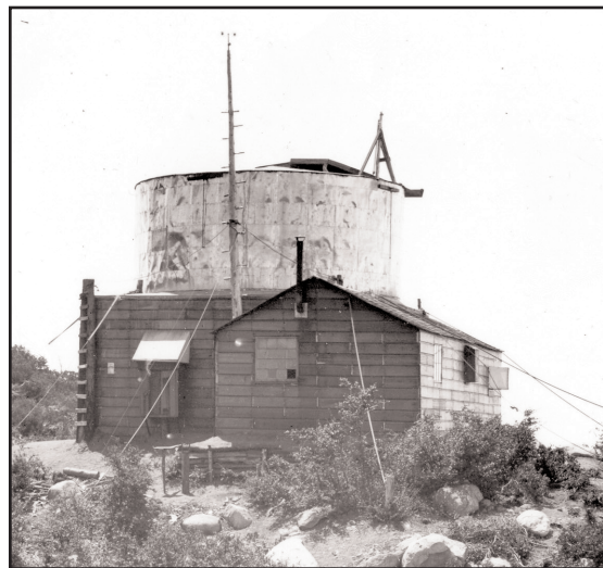
Harvard Observatory on Mount Wilson, ca. 1889.

October 14 Tuesday 7:30 PM Senior Center in Memorial Park 222 W. Sierra Madre Blvd.