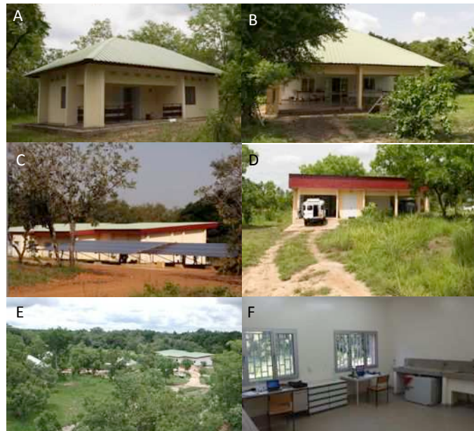
Fig. 2 Pictures of the Comoé NP Research Station. A: A house; B: The Refectory; C: The lab and solar panels; D: The Garage; E: Overview from Water tower; F: One of the lab rooms.

http://www.biozentrum.uni-wuerzburg.de/comoe_research_station