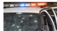
Dashcam shows cop's confrontation with killer