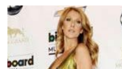
Does Celine Dion