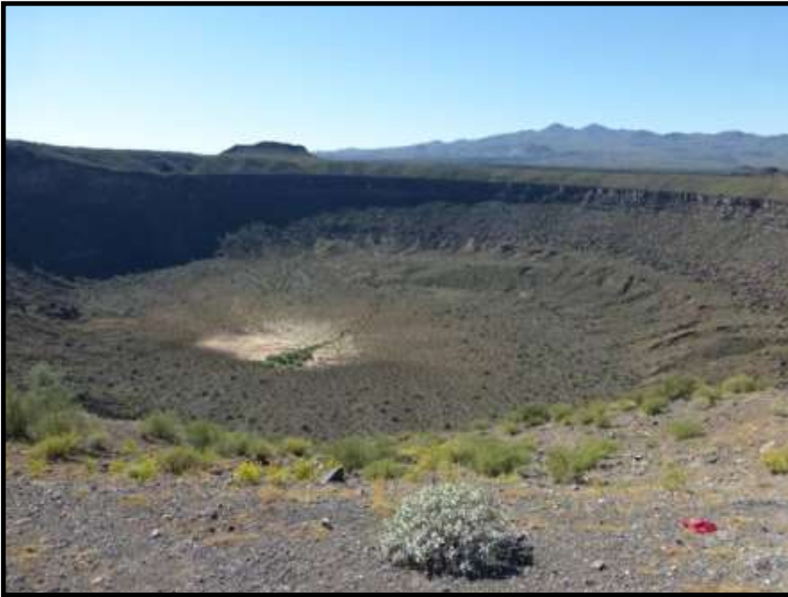
More photos from the Mexican Fiesta—(Clockwise from left) The cinder volcanic crater at Picante Mountain new Rocky Point. Art Ashton takes a breather while hiking to the crater. The view of Cholla Bay from the beach. Local birds in Mexico.