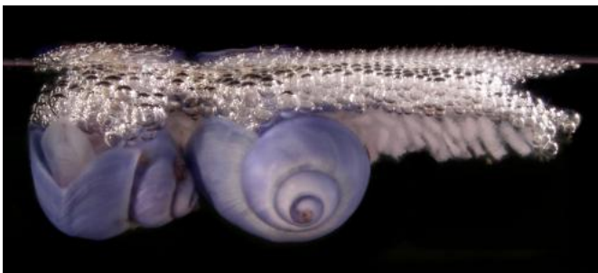
Two female bubble-rafting violet snails, Janthina exigua .

To know which scenario was correct, the researchers needed to find a transitional form---a janthinid with characteristics that fall somewhere between the bottom-dwelling epitoniids and the permanently-rafting janthinid known as the common purple snail ( Janthina janthina ). They got a break when they received a preserved specimen of the rare rafting snail Recluzia from Australia.