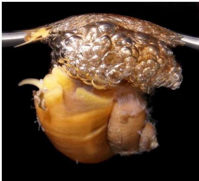
A rare bubble-rafting brown janthina snail, Recluzia cf. jehennei . Scientists believe the bubble float evolved from an ancestral egg mass.

(PhysOrg.com) -- It's "Waterworld" snail style: Ocean-dwelling snails that spend most of their lives floating upside down, attached to rafts of mucus bubbles.