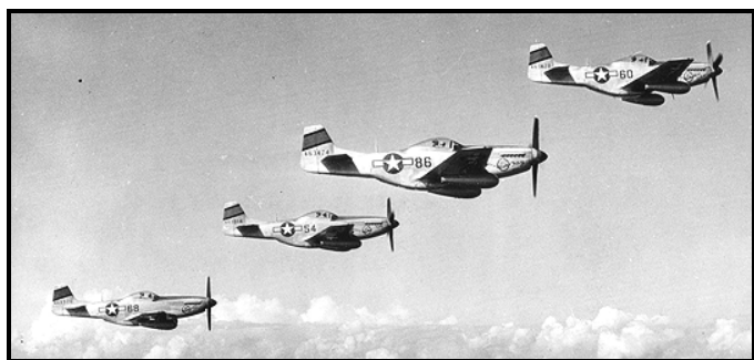
45th FS on Mission to Japan