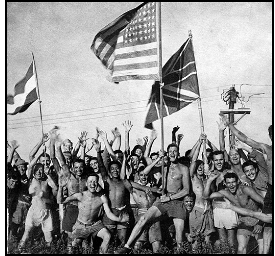
POW's being released

In a few days, the British arrived and took their people plus 3 Norwegians but would not take the others. Two days later the Navy came in, took their people and left us there. We finally were taken out by the Army on August 30 and taken to Atsugi Airfield where we departed for the Philippines on September 1. I finally arrived home on October 17, 1945.