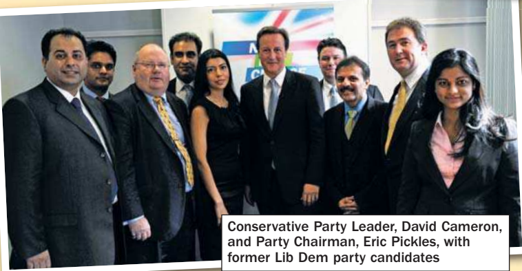
Conservative Party Leader, David Cameron, and Party Chairman, Eric Pickles, with former Lib Dem party candidates