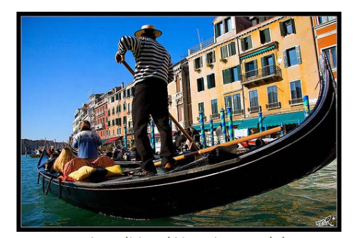
A traditional Venetian gondola