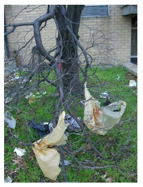
Plastic bags littering the environment