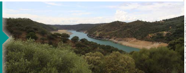
Sierra de Guadalupe

One-of-a-kind adventures to the world's most fascinating places. Join us.