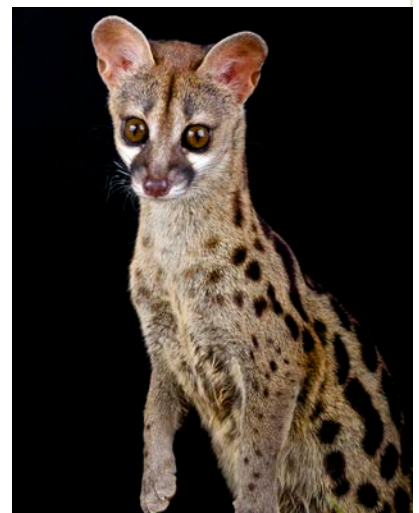
Photos: El Rocío, Two-tailed Pasha, Black Vultures, Genet