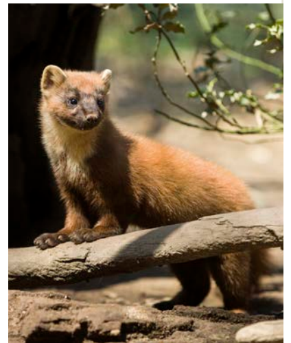
Photos: Cantabrian Brown Bear, Somiedo Natural Park, Pine Marten