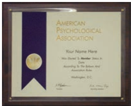
Actual size 11" x 13 1/2"