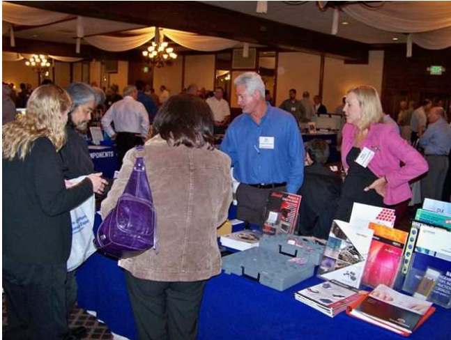
Proud Bird Show, March 3, 2010 More: www.erascal.org/ShowPhotos-10/2010PBShow.pdf