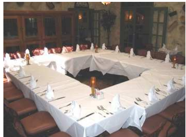
An Owner's Forum table set for twenty-four.

ERA Owner's Forums cover a wide range of rep business operations issues: leadership, company ownership, management, staffing, compensation, buy-sell agreements, disability, succession, dealing with principals and customers, commission issues, etc. These are lively sessions where some issues are "personalized" by participants and used to solve their own problem.