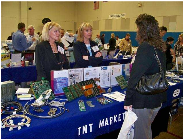
Goleta Show, April 20, 2010 More: www.erascal.org/ShowPhotos-10/2010GoletaShow.pdf