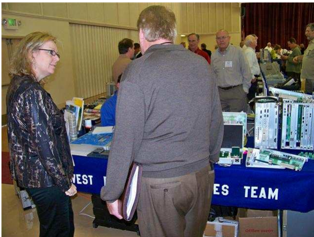
Camarillo Show, April 21, 2010 More: www.erascal.org/ShowPhotos-10/2010CamarilloShow.pdf