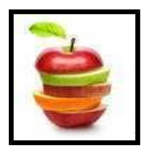
What a great way to start the day!!

The Beenleigh State High School Breakfast Club will be providing a free breakfast for all students from Chaplain's room every day except Tuesdays. Breakfast Club from 8:00am – 2:00pm.