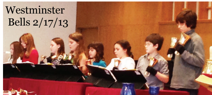
Westminster Bells 2/17/13