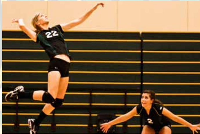
Above photo originally appeared in the Napa Valley Register 08/30/09.