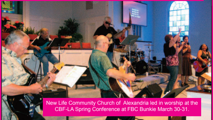
New Life Community Church of Alexandria led in worship at the CBF-LA Spring Conference at FBC Bunkie March 30-31.

April-May-June 2012 Volume 19, No. 2 cbfla.org