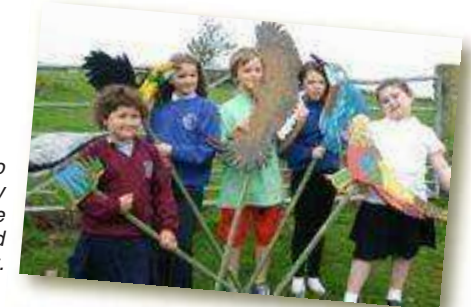
Children from Dalry in Edinburgh meeting to exchange birdy facts with children from Dalry Dumfries and Galloway at the Galloway Red Kite Feeding Station as part of the Watson Bird Project.

There will be some bird art activities in the Town Hall between 10.30am and 12am on Saturday 22 September. Come and make a bird with us!