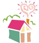
Food and Shelter

Food items are needed to pack lunches and provide snacks for GAIHN guests during host week. A display containing a list of needed items as well as a sign up sheet is located in the Parlor. The items should be returned to the Kitchen in the Activities Building no later than 11:00 am on Sunday, March 20.