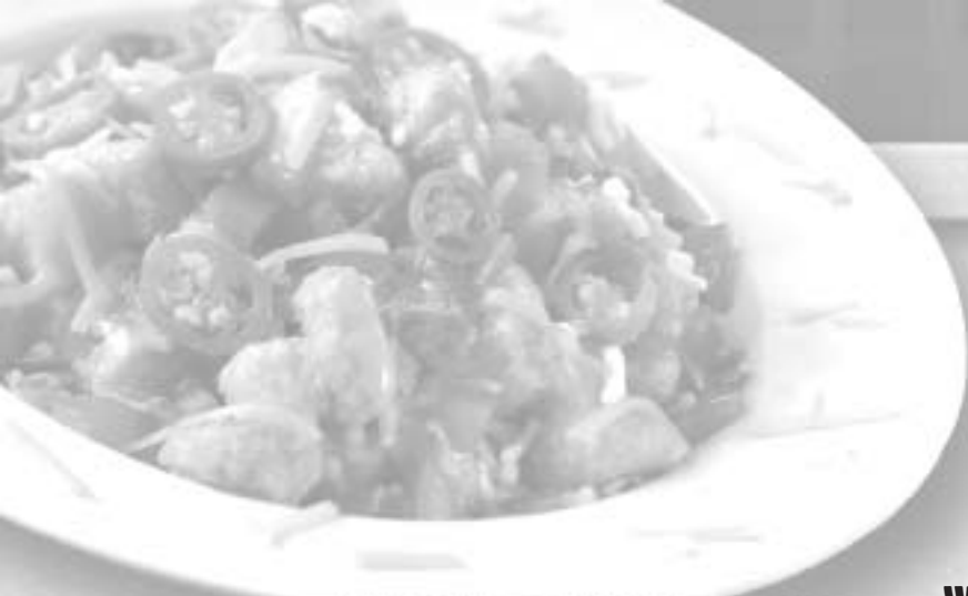
WingStreet® Nacho Taters