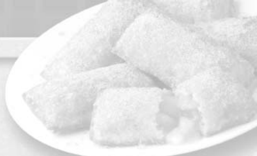
WingStreet® Hot Cinnamon Apple Pies

Call us for Carryout, or Join us for Dine-In!