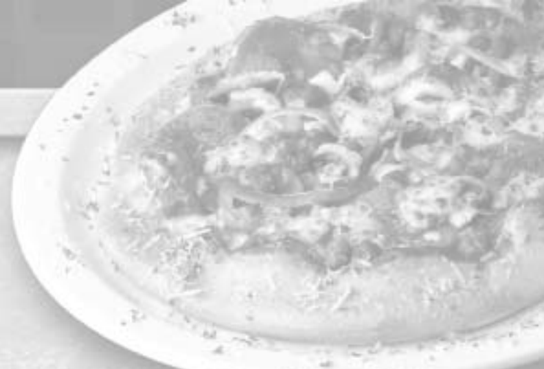
Individual Hand-Tossed Style