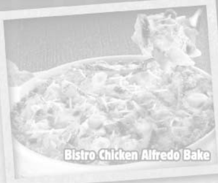
Bistro Chicken Alfredo Bake