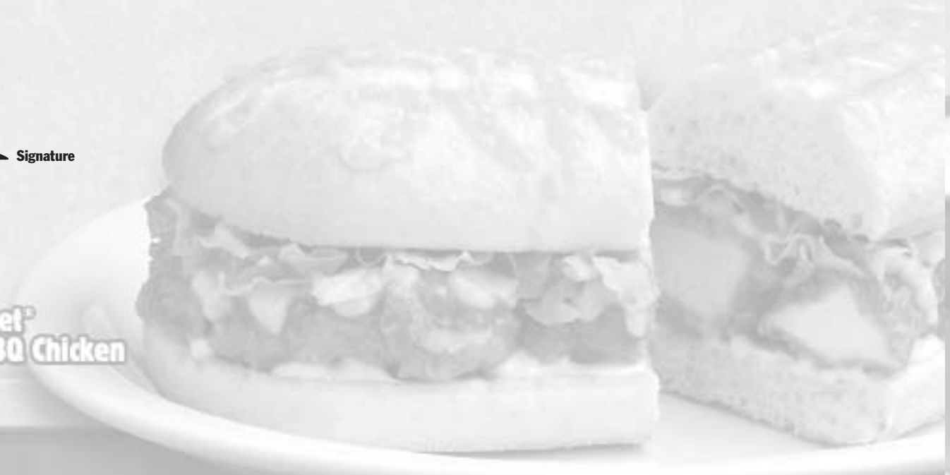
WingStreet® Honey BBQ Chicken