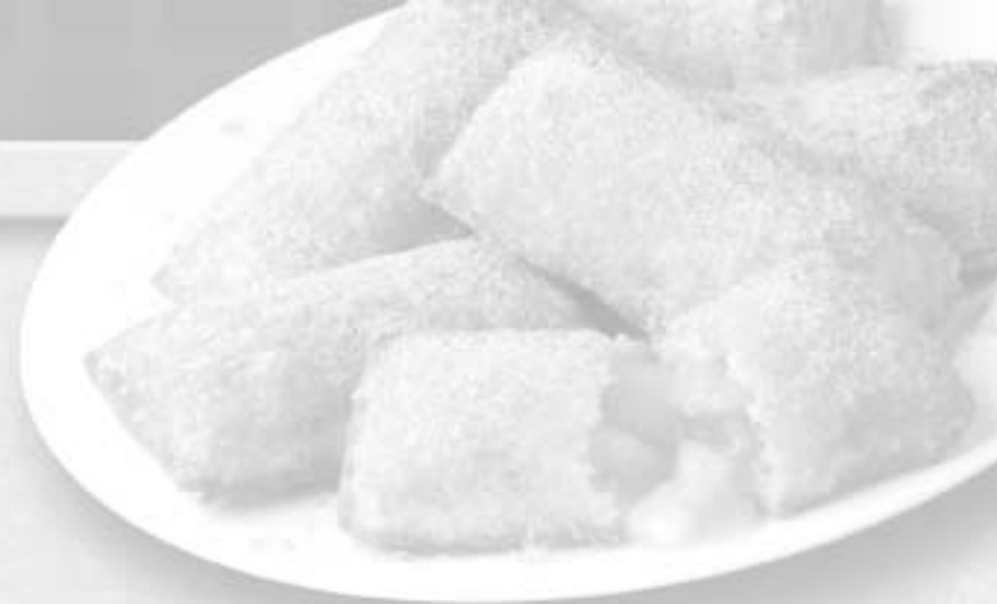
WingStreet® Hot Cinnamon Apple Pies

Call us for Carryout, or Join us for Dine-In!