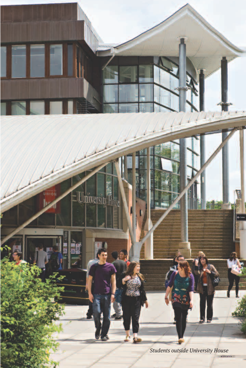
Students outside University House