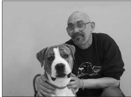
Plug with Gizmo