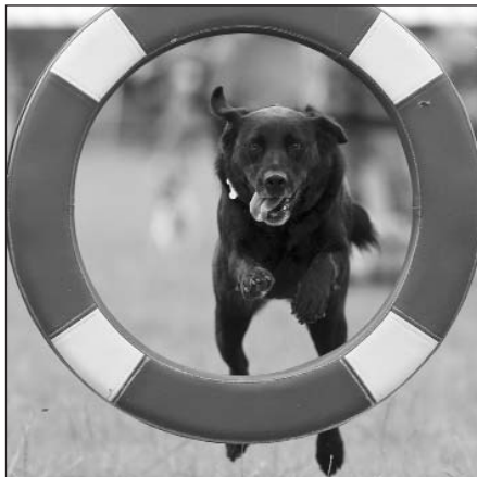
Dog having a go at Dog Show

and Fun Day but this year we had a change of location. Due to the limitations imposed at Ashton Court we felt that there was little room for developing the event. After a long hunt for a suitable venue we finally relocated to Whitehall Rugby Football Club in Speedwell, not too far from the Centre. This venue provided us with the opportunity to increase our income and decrease our expenditure which is exactly what we achieved. Despite its lesser known location, thousands of people turned out to enjoy the warm summer day with their family and four legged (sometimes three!) friends. The event raised £5,049.36 profit, nearly £2,000 more than in 2009! Well done to everyone involved and lets hope we can make it an even bigger hit in 2011.