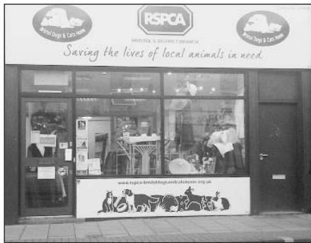
New fascia on the Charity Shop

The dog show in June was fantastic this year and I feel sure we will be back in Whitehall again this year all being well. The Fundraising team did a tremendous job organising this event and the delicate decision to move the event to a new site paid off, so well done to all concerned.