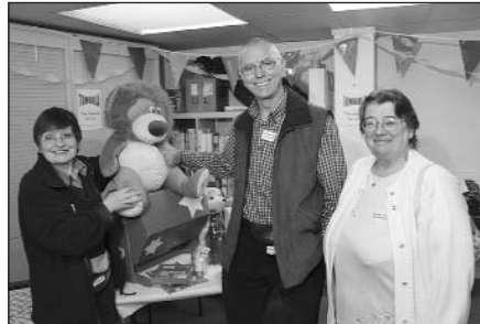
Volunteers at Spring Fair

The final event in our calendar, the Home's annual Christmas Fair, ended the year on a high. We were back over at the Dogs Home after the completion of the new small animal unit, so it was a bit of a squeeze. It was a bright, if cold day and despite a few blue lips, the day was a massive success. The crowds turned out in record numbers which really boosted everyone's spirits and a great day out was had by all. We really went out with a bang as the event raised over £3,500 profit (nearly £1000 more than 2009!), more than ever before!