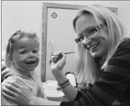
Volunteer face painting

we were able to keep costs down thanks to the generosity of all organisations who donated prizes, especially Paul Roberts Hi-Fi and Ramada Plaza Hotel for our top prizes. As a result we actually raised over £200 more than last year.