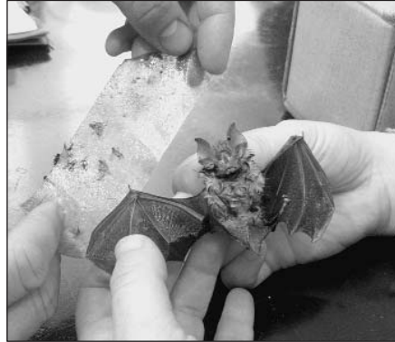
Bat stuck on fly paper

We took in 838 wildlife casualties, one of which was a little bat who had got himself into a bit of a predicament. He had flown into a sticky fly strip and, along with lots of unfortunate flies, found himself firmly attached to it. He was rescued by a member of public, who carefully peeled him off the paper, then brought him into the Clinic for assessment. Luckily there were no physical injuries, but there was still glue on his wings,