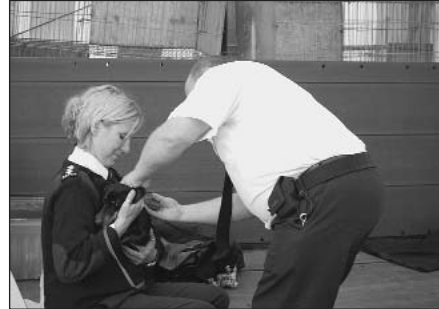
Microchipping a dog at Badminton

We attended Badminton again this year, and decided to be more pro-active in our attempts to fund raise. So as well as monitoring dogs in hot cars and stray/sick dogs, we had a few fund raising ideas within our tent and also decided to micro chip dogs in return for a donation. This proved far more popular than anticipated and attracted visitors to the event as well as organisers and the local farmer! I used 99 of the 100 chips I ordered and managed to raise about £600, which again went into the regional fund. Our push on microchipping proved its point when we picked up a stray that was chipped and shown as belonging to someone in Lithuania! Fortunately, before we made a decision whether to incur an